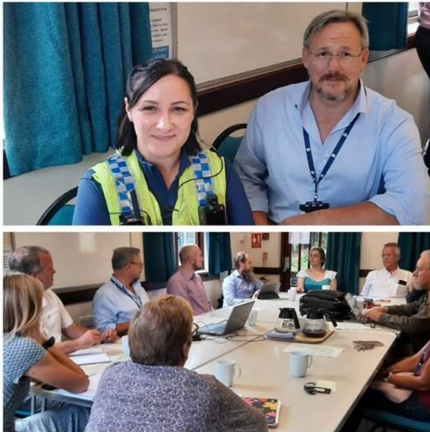
2 - Meeting held with partners in Colehill.