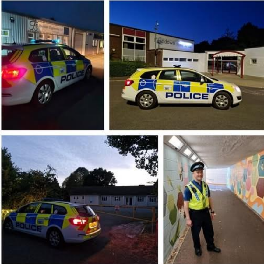
4 - ASB Patrols across East Dorset with PCSO Adam.